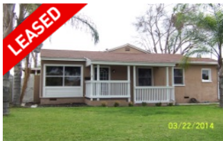
1646 Alameda, Pomona Single Story Home 3BR/1BA - $1,600