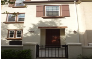
6967 Vining, Chino Townhome 2BR/2.5BA - $1,850