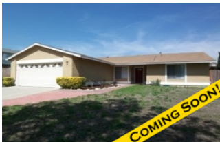
17552 Wabash, Fontana Single Story Home 3BR/2BA - $TBD