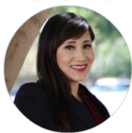
Hawaii & Paris