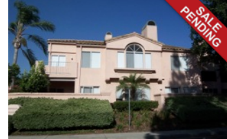
2708 Montego #B, Ontario Upper Level Condo 2BR/2BA - $240,000