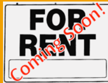
10184 Camulos, Montclair Single Story Home 2BR/1BA - $TBD