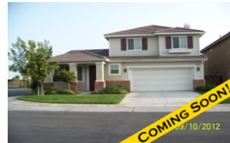
1110 Sawtooth, Upland Two Story Home 3BR/2.5BA - $TBD