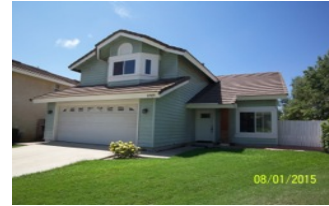
8909 Avalon, Rancho Cucamonga Two Story Home 4BR/2.5BA - $425,000