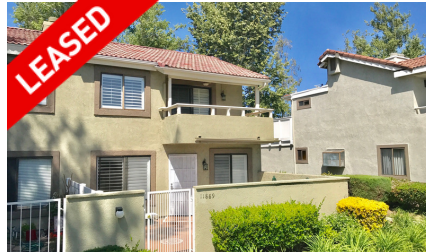
11889 Seneca Way Chino

Upper Level Apartment with Detached 1 Car Garage 2BR/1BA - $1,550