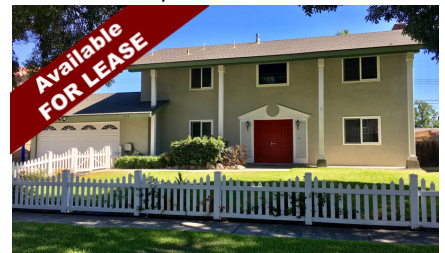
1194 E. Eddington St. Upland

Townhouse Style Apartment with Small Yard, 1 Car Garage, & 1 Assigned Parking Space 2BR/1.5BA - $1,450