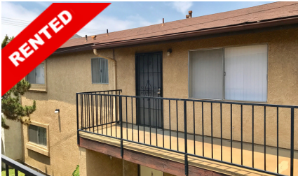
907 N. Dalton Ave. #D Azusa

Upper Level Apartment with Detached 1 Car Garage 2BR/1BA - $1,550