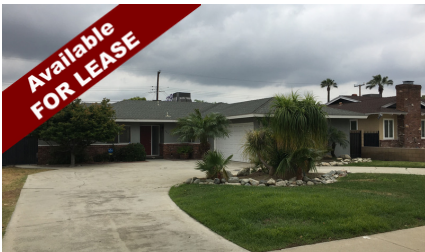
525 W. Berkeley Ct. Ontario

Single Story Condo with Detached 1 Car Garage & Assigned 1 Car Parking Space 2BR/2BA - $1,500