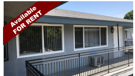
383 Orchid Ln. #R Pomona

Upper Level Apartment with Detached 1 Car Garage 3BR/1BA - $1,500