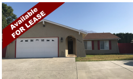
9524 Church St. Rancho Cucamonga

Upper Level Apartment with Detached 1 Car Garage 3BR/1BA - $1,500