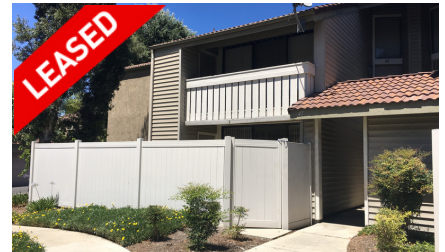
47 Carriage Way Pomona (Phillips Ranch)

Two Story Condo with Attached 2 Car Garage 2BR/2.5BA - $1,850