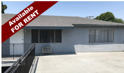
383 Orchid Ln. #Q Pomona

Single Story Home with Attached 2 Car Garage 3BR/2BA - $2,100