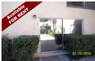
888 N. Palm #7, Upland Townhouse Style Apartment 3BR/1 & 3/4BA - $1,400