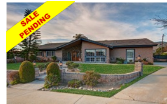
1133 Aldersgate, La Verne Single Story Home 4BR/3BA - $850,000