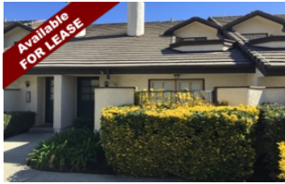
978 #C West Arrow Hwy, Upland Townhouse 2BR/2.5BA - $1,700