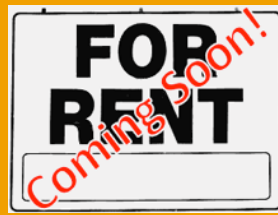
907 N. Dalton #C, Azusa 2Br/1BA - $1,500