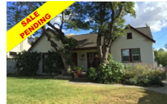
3296 Fair Oaks, Altadena Single Story Home 3BR/1.5BA - $649,900